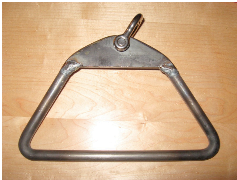
Figure A-2: The Handle