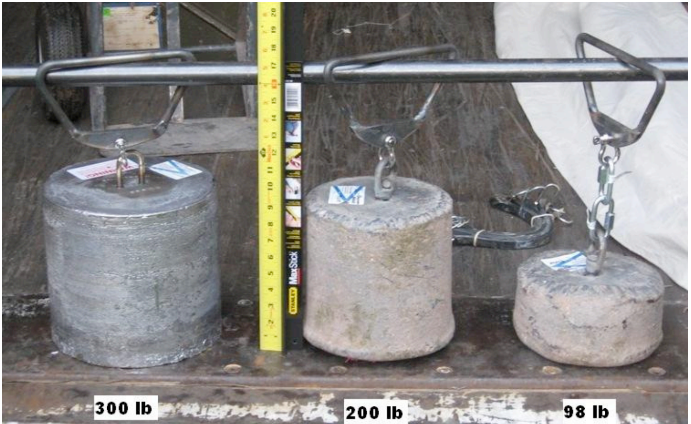
Figure A-1: The Ultraweights