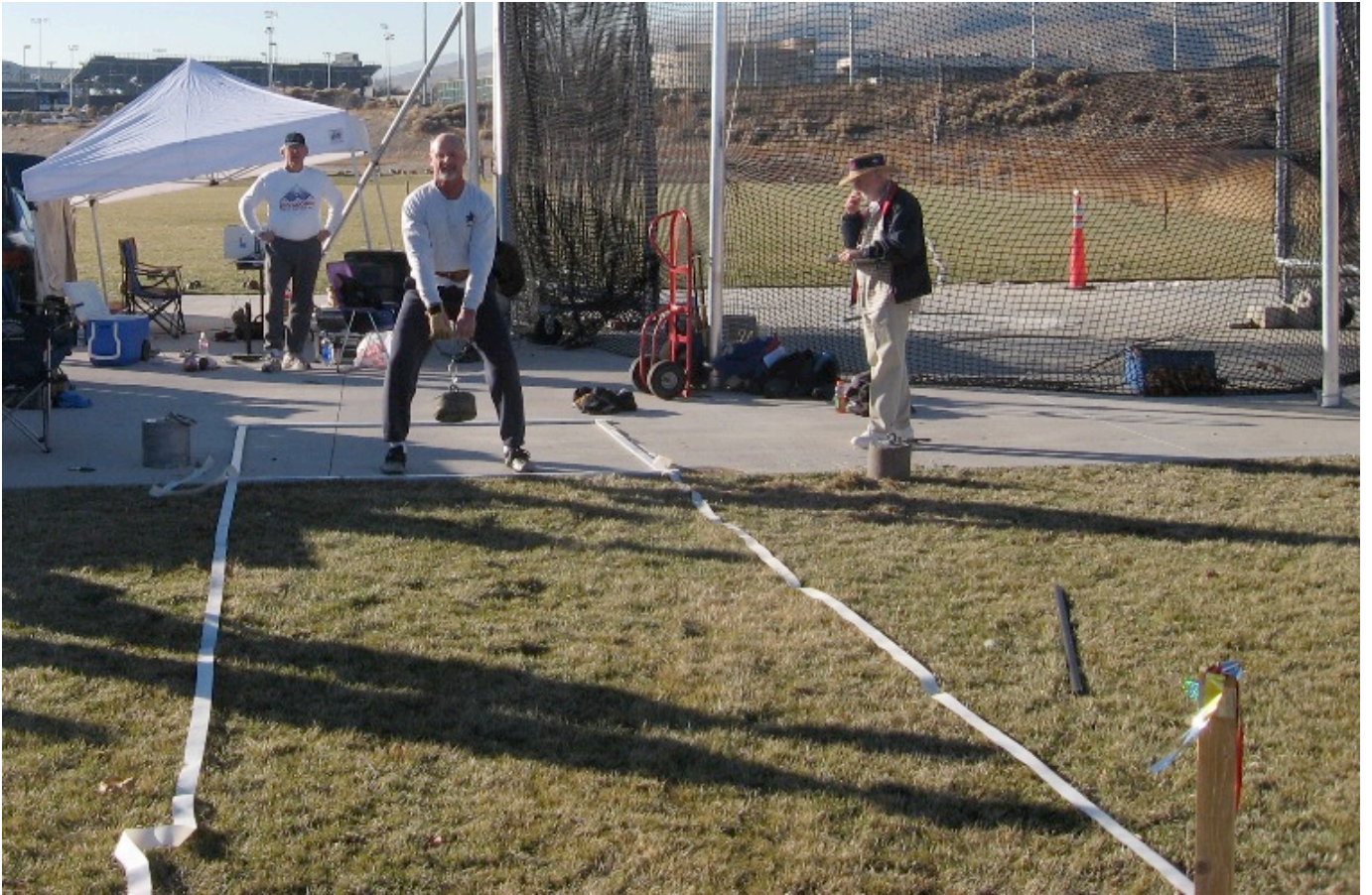
Figure A-5: Throwing Square (2)