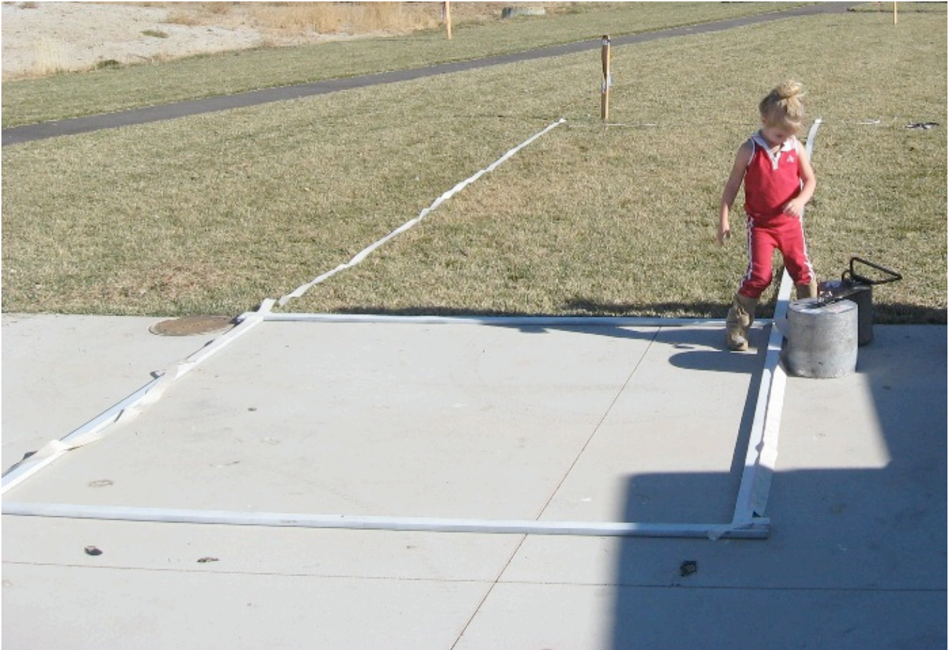
Figure A-4: Throwing Square (1)