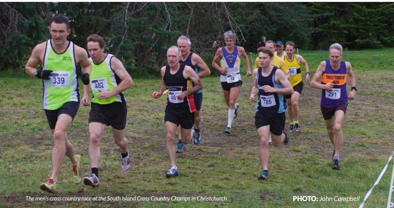
The men's cross country race at the South Island Cross Country Champs in Christchurch