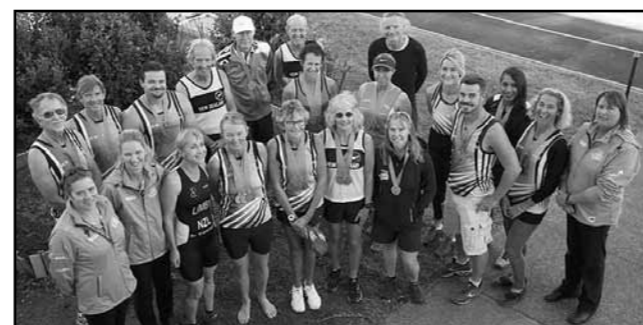
Northland Masters at the World Games in Auckland

The Northland committee is busy with getting plans in place for the Nationals in Whangarei next year. One of the top priorities is the search for a sponsor of the championships. We are looking forward to seeing many of you up here in the North taking part in the champs in Whangarei.