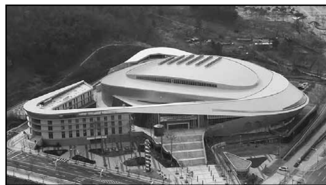
Indoor stadium at Daegu, South Korea