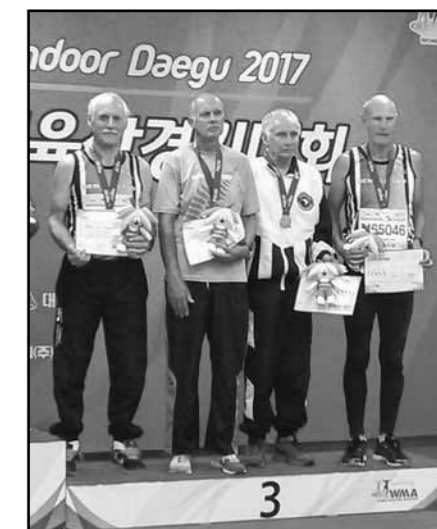
The NZ men's M65 4 x 200m relay team receiving their medals at Daegu

A reminder all participants need to be Club or NZMA financial members for records to be accepted.