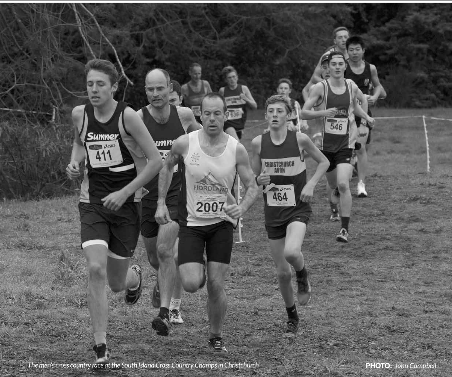
The men's cross country race at the South Island Cross Country Champs in Christchurch