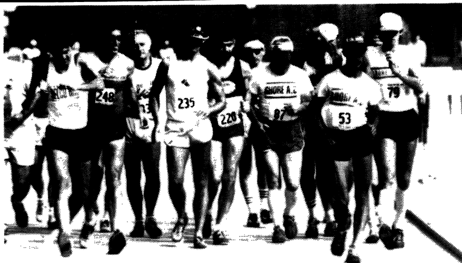
Walkers start out in 1980 National Masters Championships in Philadelphia.