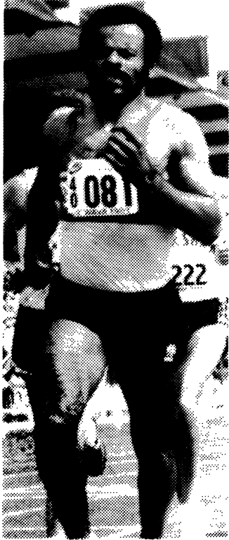
George Cohen of California, U.S. record holder in the 800 and 1500 for age 40, pictured at the World Games in New Zealand.